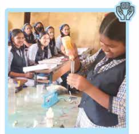
Science on Wheels, Vasundhara Science Centre, Maharashtra