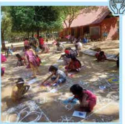
Educational Support to Timbaktu Collective for The Nature School, Andhra Pradesh