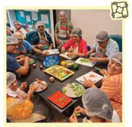
Cooking Workshops for Differently Abled Adults, Anchorage Shelter, Maharashtra