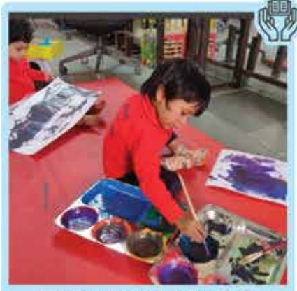
Providing Art and Play Therapy to children at Palna, Delhi Council for Child Welfare, Delhi