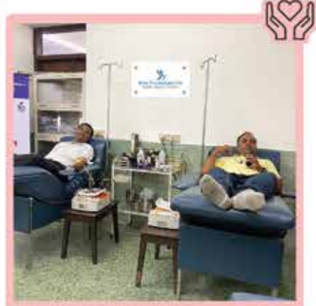
Supporting Indian Red Cross Society's Blood Centre, Maharashtra