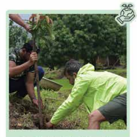
Tree Plantation Drive, Maharashtra