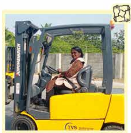
Skill Development (Driving Course) for Women, Association for Non-traditional Employment for Women (ANEW), Tamil Nadu