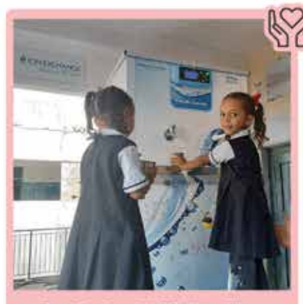
Providing Eco Chill RO Water Filter, Kubereshwar Prathmik Shala, Gujarat